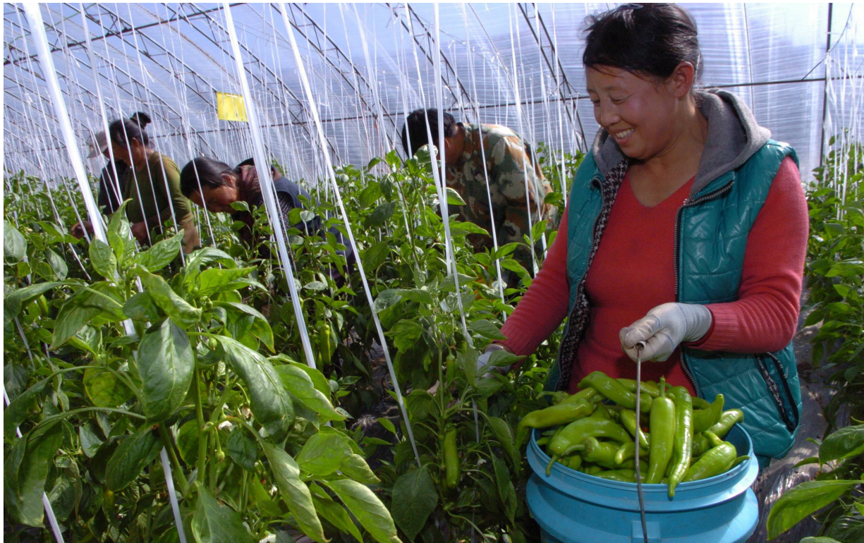
Grow organic featured agricultural products

that batik art, the ancient paper-making techniques, the craftsmanship of weaving birdcages were initially passed down to meet the living demands of the local Miao people for dyeing cloth, practicing calligraphy and bird feeding. Nowadays, though the production of the above-mentioned handicrafts still follows the old workshop craftsmanship and techniques, the means of marketing is modern and their targeted customers have a wide base and high-end demands. For example, some enterprises require their logo T-shirts be dyed with the batik craftsmanship to enhance the taste of the company culture; some batik and birdcage handicrafts are sold on the JD.com online shopping site; and the ancient paper-making, when having met the demands of the country and the people for paper of higher quality, has offered the tourists opportunities to experience